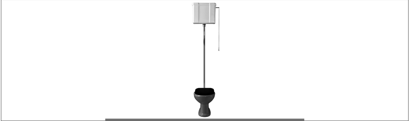
Sanitari e Consolle-Pompei PHPM12